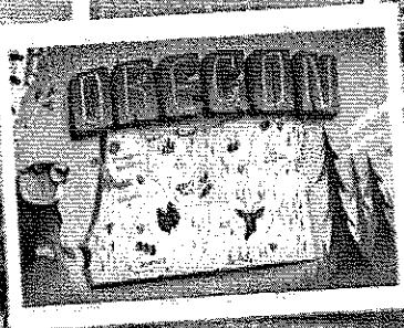
River Wing Room D2